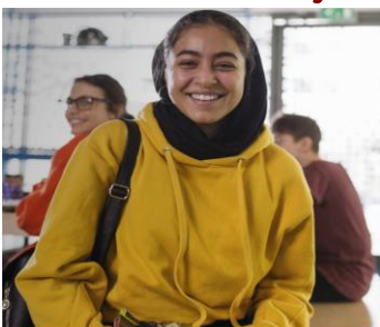
LIFE AFTER RESULTS DAY

Join a live webinar with Young Enterprise on Friday 21 st and Monday 24 th August at 3pm. You'll hear from inspirational speakers who'll share their stories of life after results day and how they came to be where they are today. They'll also provide valuable advice on how to make the most of your results, whatever they may be.