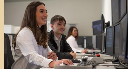
LEVEL 6 APPLIED PROFESSIONAL ENGINEERING PROGRAMME DEGREE APPRENTICESHIP

The evolution of vehicles has never been more exciting. Find out more about apprenticeship opportunities, get hints & tips for your applications, and hear from current apprentices about why they think Jaguar Land Rover is the perfect place to start your career. Level 3 up to degree level.