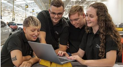
LEVEL 3 ADVANCED APPRENTICESHIP

Apprenticeships at Jaguar Land Rover - Become the Future of Movement – 8 Feb at 18:30 – 19:30