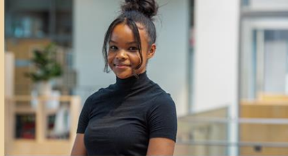
LEVEL 6 DIGITAL AND TECHNOLOGY SOLUTIONS DEGREE APPRENTICESHIP