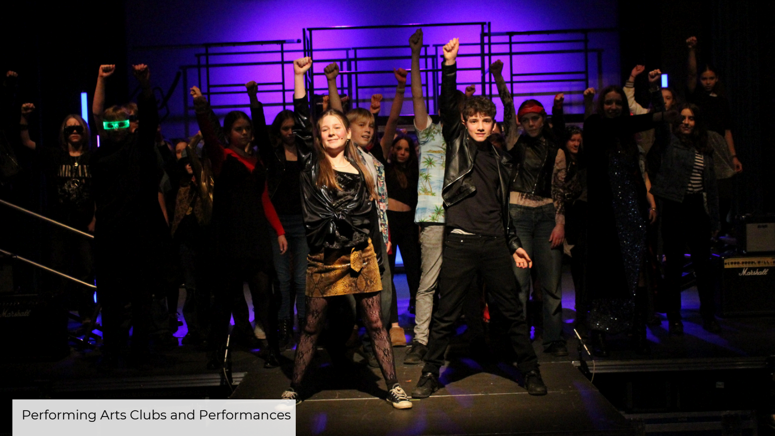
Performing Arts Clubs and Performances